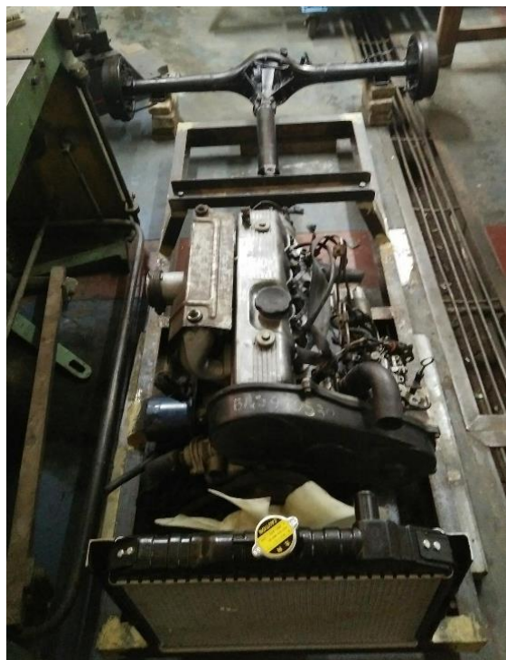
Figure 1. Diesel engine performance testbed