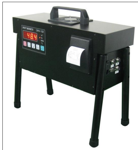
Figure 3. Automotive opacity smoke meter